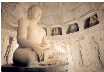
The main rotunda of the Seokguram Grotto