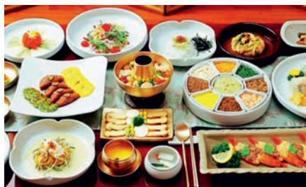
Traditional Korean cuisine served at the royal court of the Joseon Dynasty

Unique to the 2011 WCD, the KDA Seminars were introduced by the host Korean Dermatological Association with the intent to provide a greater variety and quantity of educational opportunities for those seeking to get the most out of the Congress. Six KDA Seminars will take place each morning from 7 to 8 am. Early morning shuttle bus service and light breakfast (coffee and pastries) will be provided for the seminars.