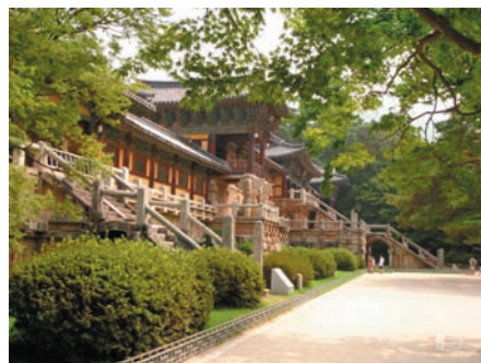
Majestic entrance to Bulguksa Temple

Many pre and post congress tours will be available to other parts of Korea, such as the famed Jeju Island, and neighboring countries like China. For detailed information about the tour program and to reserve a tour spot, please visit the Congress website at www.wcd2011.org .